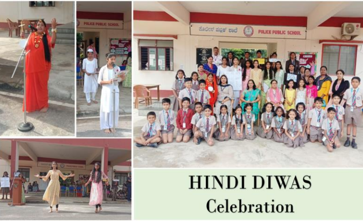
HINDI DIWAS Celebration